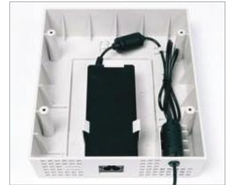
An optional power supply tray for retail installations