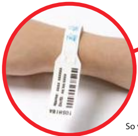
So versatile that even specialist labels and tags can be printed with ease