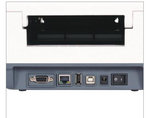
Built-in networking as standard with a 10/100Mbps LAN interface