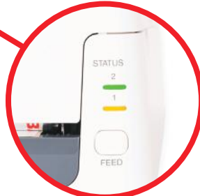
Easy operation with clear multi-coloured LED status indicator